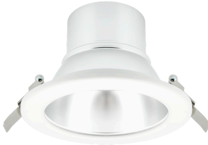
Alzak Multiplier EM4-40-AZ 120-277V AC / 4000K / 700Lm / 9W